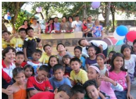
Front View: Opening Day