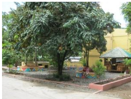
Back View with rest area